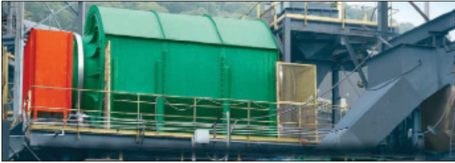
This Bradford Breaker has performed for over sixty years at this Appalachian coal mine.

The drive assembly is uncomplicated and trouble-free, allowing the use of a single, normal starting-torque motor. Because of the great strength of our cylinder, it is driven from only one end. This eliminates the need for an additional jack shaft to balance torque and to drive both ends of the cylinder.