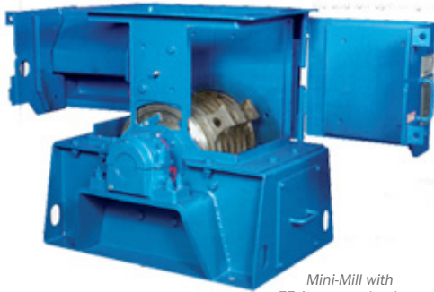
Mini-Mill with EZ-Access technology.

These Mini-Mill™, 30ABE and 34ABE models include the same features as our large hammermills.