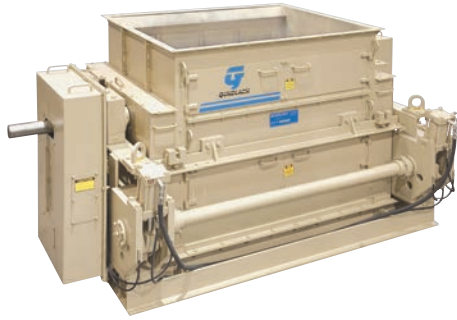
4000 Series Roll Crusher