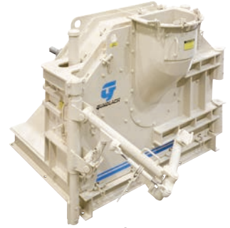
Cage-Paktor® Cage Mill