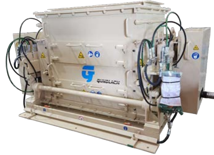
2000 Series Roll Crusher