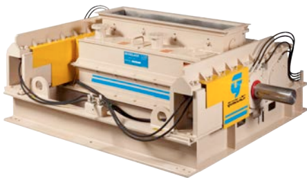
Nanosiz-R® Roll Mill