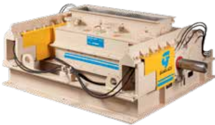
NANOSIZ-R® Roll Mill