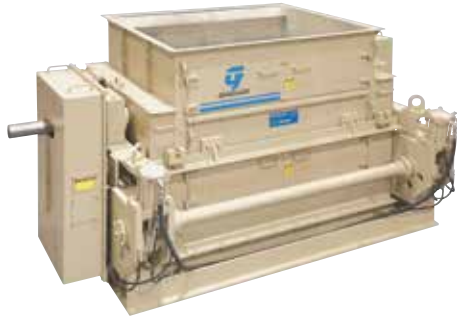
4000 Series Roll Crusher