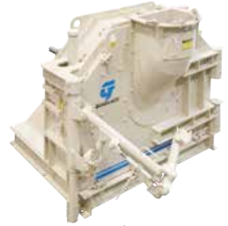
Cage-Paktor® Cage Mill