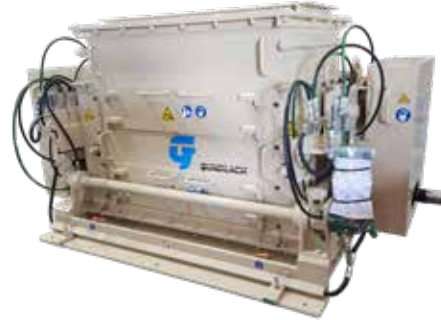
2000 Series Roll Crusher