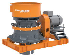
Saxum Floating-Shaft Cone Crusher™

TerraSource Global has a full range of turn-key solutions for all your crushing and feeding operations.