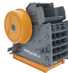
Silex Jaw Crusher™