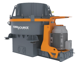
Tritura Vertical-Shaft Impactor™